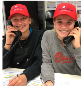
Even our students jumped in to help in the Giving Day call centre.