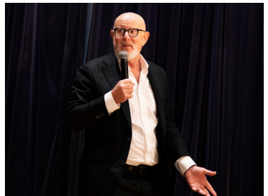
Comedian Peter Berner hosted the 2021 Foundation cocktail party.