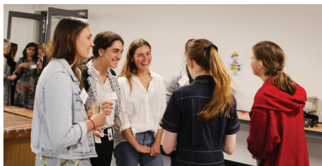
Senior robotics students meet alumni pursuing careers in STEM.

In 2017 we extended our program to women working and studying in scientific fields, hosting an event at the Lowy Cancer Research Centre. We are excited to have now broadened this event to include parents and alumni forging careers in all areas of STEM – science, technology, engineering and maths.